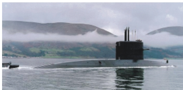
"Hr. Ms. BRUINVIS"