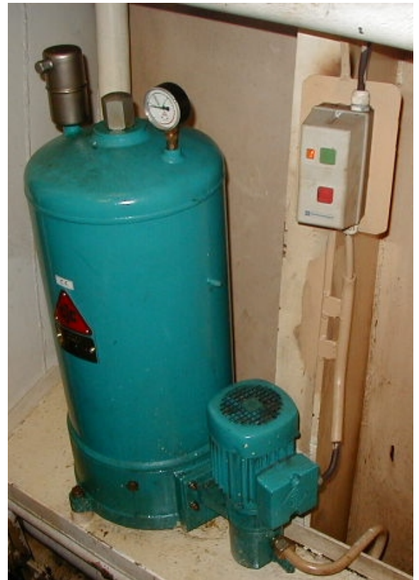
CJC™ Fine Filter type HDU 27/54 MZ installed on the reduction gear of M/S Chilean Reefer.

On a yearly basis with 7,600 running hours this reduces the amount of dirt passing the lubricating pump from 371 kilos to 45 kilos, increasing pump life by a factor 4.