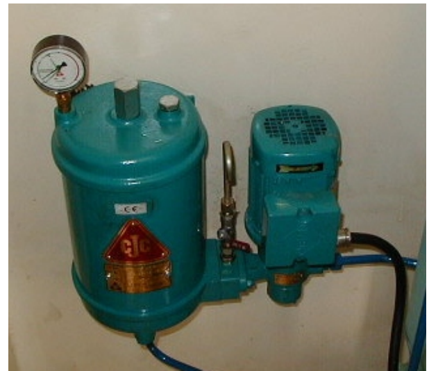
CJC™ HDU Fine Filter type 15/25 installed on the crane of M/S Chilean Reefer.