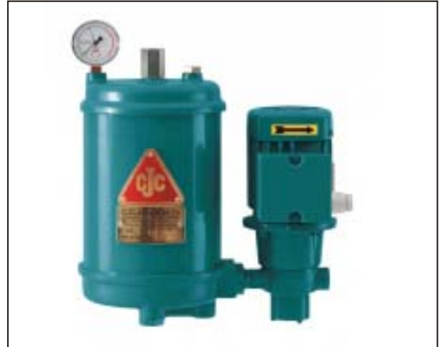
CJC Finfilter HDU 15/25 PM

The ultimate result is a considerable - 1) extension of the oil and system component lifetime, and 2) improvement of the operational reliability, which dramatically reduces the risk of unplanned system downtime.