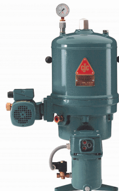
The CJC™ Filter Separator PTU2 27/27